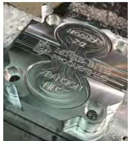
Op 2 including c'bore on same fixture

Continuous Improvement Programs = Innovation!