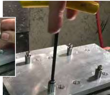
Install tapered drive screw