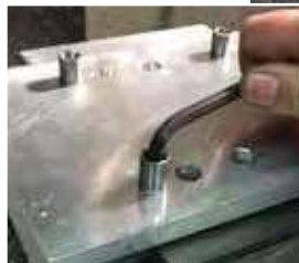
Install pin body