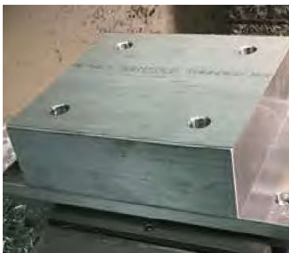
Raw stock on pins