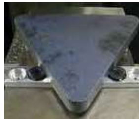
Odd shaped parts