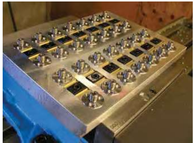
Fixtured with Mitee-Bite Machinable Uniforce® Clamps