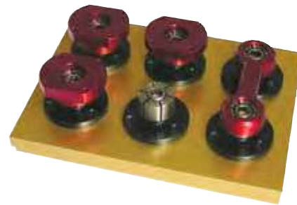
Vise Pallet with ID Xpansion™ Clamps

The Mitee-Bite Vise Pallet has a locating pin that makes contact with the left side of the solid jaw for repeat location of pallet. Simply slide pallet to the right of the vise and clamp in place. Pallets can be machined and tapped as required.