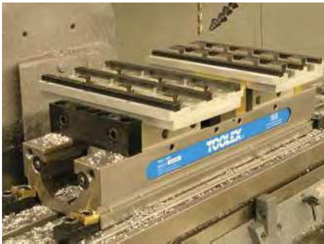
Fixtured with Mitee-Bite Uniforce® Clamps and locating rails