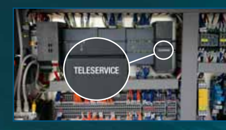
Possibility to remotely receive software updates on all the machine's electrical devices via