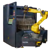
BIG 35/70 TURNING/MILLING