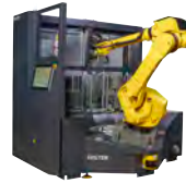
BIG 35/70 TURNING