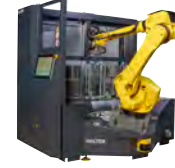
BIG 35/70 MILLING